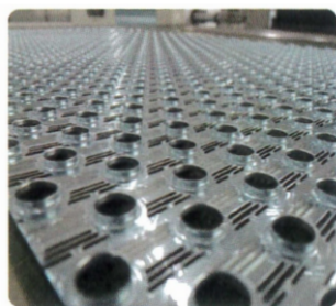
Degreasing and antifouling hydrophilic aluminum foil fins